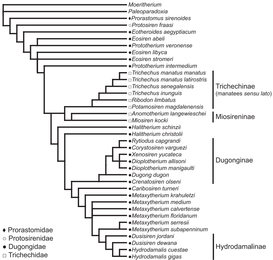
Figure 3. Phylogeny of the Sirenia including 36 species and subspecies based on 62 informative cranial and dental characters (modified after Domning 1994). TL = 162, CI = 0.76, RI = 0.91.

In fact, Simpson (1945) and Domning (1996) demonstrate that the “Halitheriinae” rather represent a historically grown assemblage of taxa characterised by morphological features that neither substantiate a monophyletic grouping nor distinguish it from other subfamilies. The latter is amongst others corroborated by the overlap of characters such as “cheek teeth enamelled, closed roots” that were provided by Simpson (1932: 423–424) to define the “Halitheriinae”, Miosireninae and Rytiodontinae. Consequently, the designation of a new type genus is not possible.