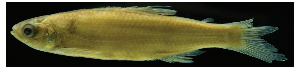
Figure 5. Holotype of Aphyocharax avary: ANSP 39217, 41.7 mm SL.