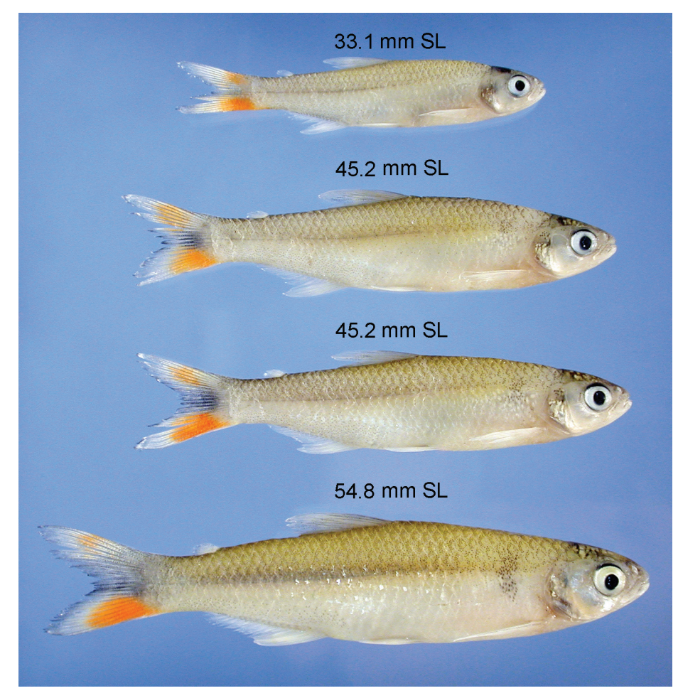
Figure 3. Recently preserved specimens of Aphyocharax pusillus : ANSP 178013, 4, 33.1–54.8 mm SL, Peru, Loreto, Rio Napo (Amazon river basin), right bank just upstream from mouth of Mazan river, near town of Mazan (3°29'10"S, 73°6'24"W).

slightly convex from this point to anal-fin origin; straight and posterodorsally-aligned along anal-fin base; postventral profile slightly concave from base of last anal-fin ray to end of caudal peduncle. Snout rounded. Mouth terminal, Lower jaw protrudes slightly beyond upper jaw when mouth closed; aligned approximately to middle of eye. Long and truncated snout, with its length larger than orbital diameter. Mouth terminal; upper jaw slightly larger than lower one. Maxillary bone surpassing a vertical line through middle of the eye; maxillary teeth small and conical, spread along proximal half of the bone. Lateral line interrupted; last scale on caudal-fin base.