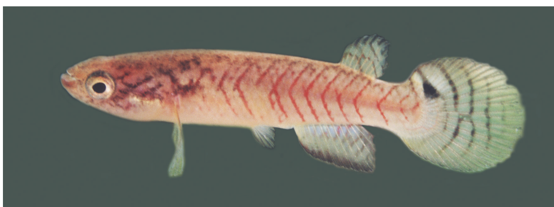
Figure 7. Melanorivulus linearis sp. n., paratype, UFRJ 11679, 23.4 mm SL.