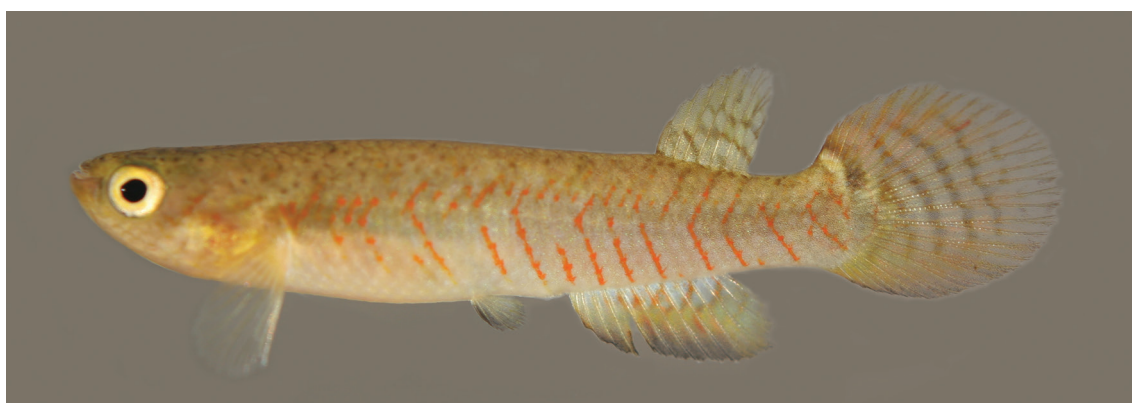
Figure 5. Melanorivulus nigromarginatus sp. n., paratype, UFRJ 8436, female, 23.8 mm SL.