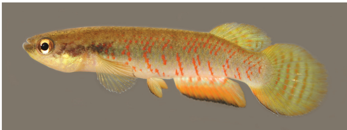
Figure 4. Melanorivulus nigromarginatus sp. n., holotype, UFRJ 8434, male, 27.6 mm SL.