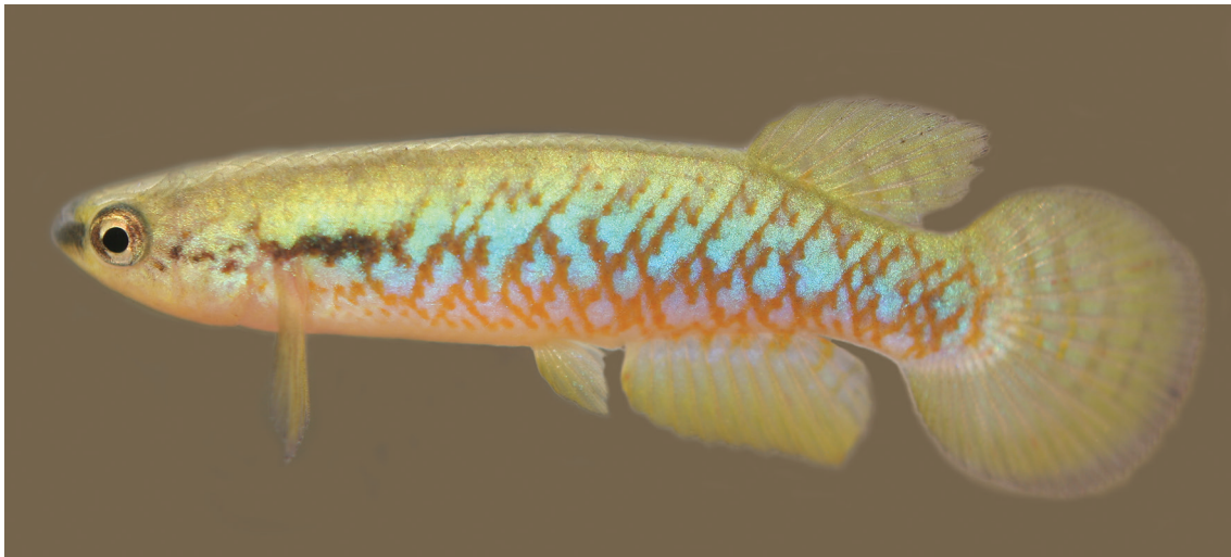
Figure 8. Melanorivulus scalaris , UFRJ 6494, male, 29.7 mm SL.

phometric, meristic and osteological characters among species of the M. pictus group makes colour pattern characters essential source to diagnose species and to estimate their relationships, since molecular data are not still available for most species. Consequently, the new taxa herein described exhibit colour patterns characters that in combination easily allow their recognition as new species, but their relationships are still unclear.