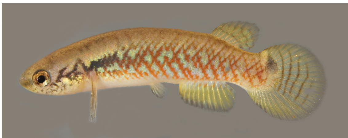
Figure 9. Melanorivulus scalaris , UFRJ 6494, female, 24.2 mm SL.

marks regularly distributed on the flank in males (Fig. 6; Costa 2005: fig. 11).