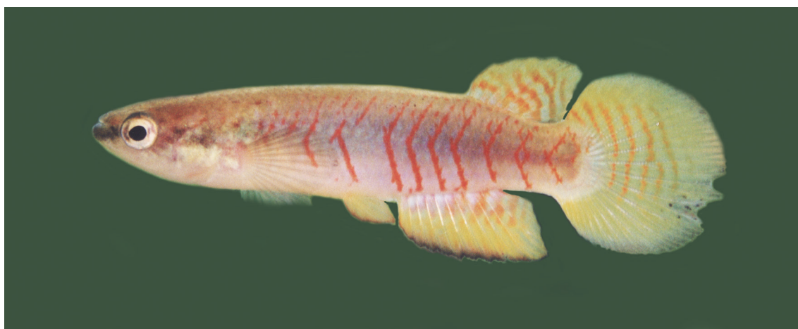
Figure 6. Melanorivulus linearis sp. n., holotype, UFRJ 11678, male, 25.1 mm SL.