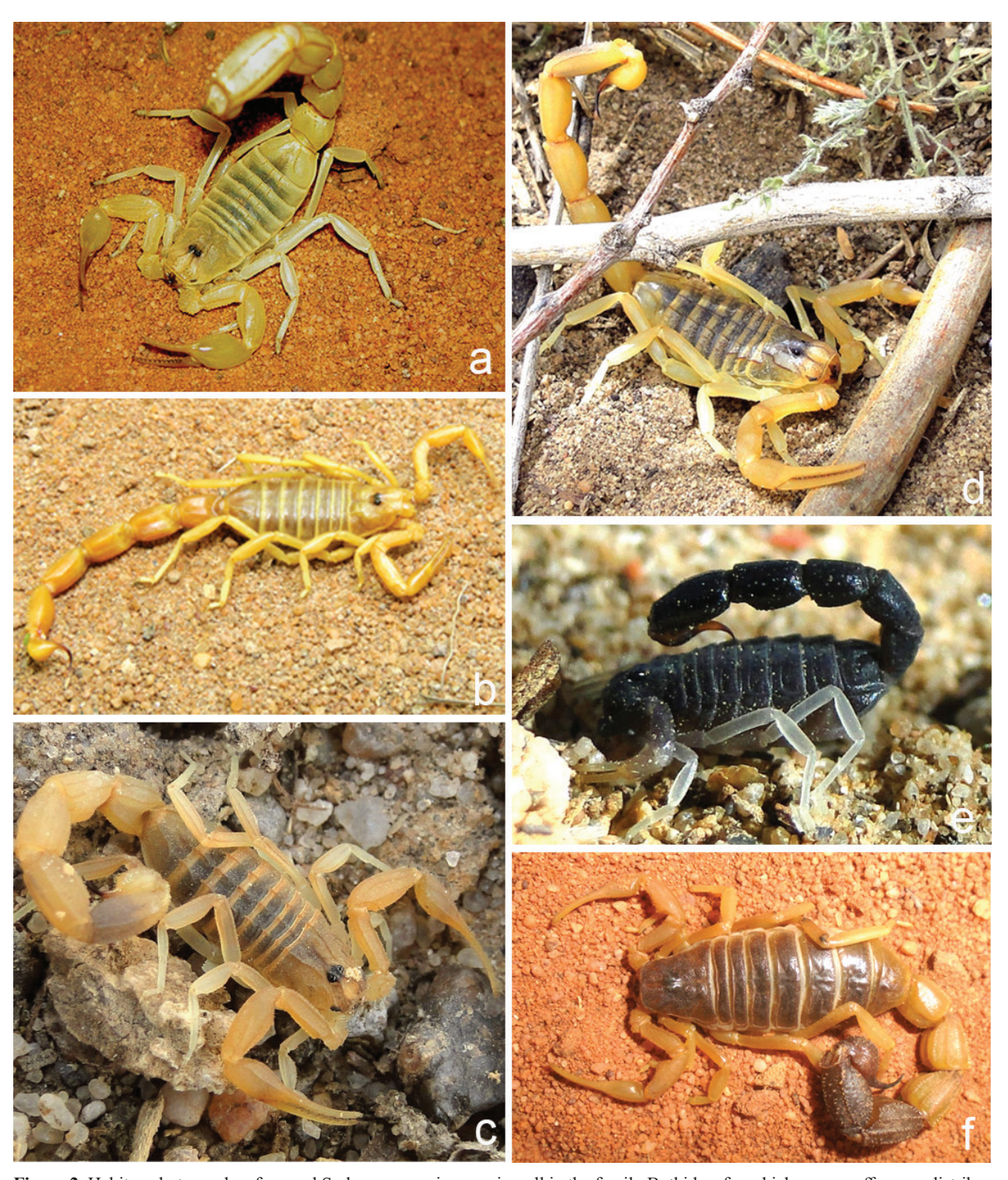
Figure 2. Habitus photographs of several Sudanese scorpion species, all in the family Buthidae, for which we can offer new distribution data here. a. Androctonus amoreuxi (Audouin, 1826); b. Buthacus leptochelys (Ehrenberg, 1829); c. Compsobuthus werneri (Birula, 1908); d. Leiurus quinquestriatus (Ehrenberg, 1829); e. Orthochirus olivaceus (Karsch, 1881); f. Parabuthus abyssinicus (Pocock, 1901). Of these, A. amoreuxi , L. quinquestriatus and P. abyssinicus have a potent venom and are regarded as medically significant.

33°16'36"E, 424 m a.s.l), leg. I. Al-Khidir, 06.12.2018., det. M. Siyam. 2♀; SNHMK 2.360, River Nile State, Mugrat Island (19°30'00.0"N, 33°15'00.0"E, 317 m a.s.l), leg. O. Khalil, 03.02.2018. det. M. Siyam, 1♀; ZMB 49465, River Nile State, El-Manaseer, Birti (16°16'08.0"N, 33°16'36.0"E, 424 m a.s.l) leg. M. Bakhit, 07.08.2019. det. M. Bakhit. 2 (juv); ZMB 49422, Kassala State, Khashm