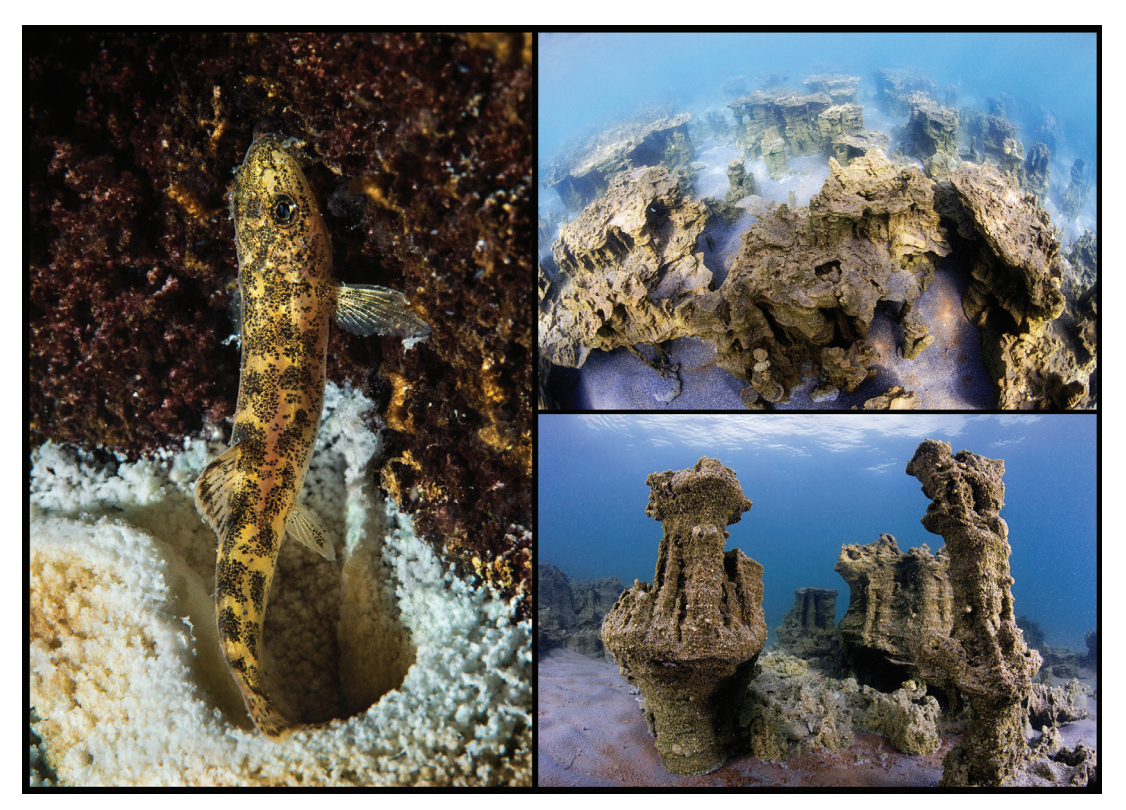
Figure 2. A lake-resident individual of Oxynoemacheilus ercisianus on the microbialite (left). Views from microbialites in Lake Van (right).