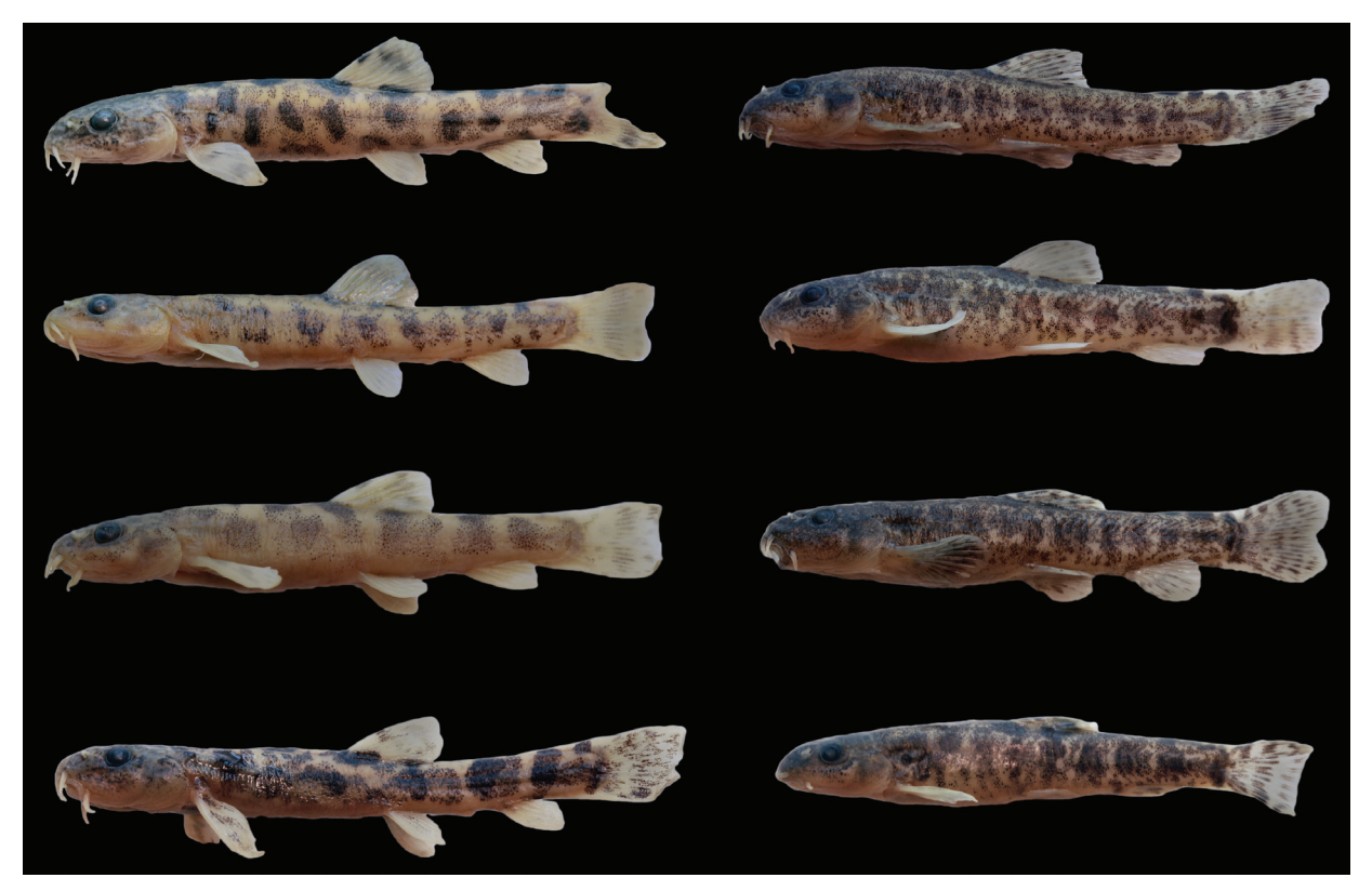
Figure 3. Oxynoemacheilus ercisianus, left from top: FFR 01403, 32.3 mm SL, 31.1 mm SL, 36.8 mm SL, 37.3 mm SL, Edremit (Lake-resident population); right from top: 37.4 mm SL, 42.0 mm SL, 41.0 mm SL, 33.4 mm SL, Bendimahi River (Stream population)

The SL of the lake-resident population ranged from 17.8 mm to 39.2 mm, suggesting smaller maximum size compared to the stream population (ranged from 30.7 mm to 66.7 mm SL).