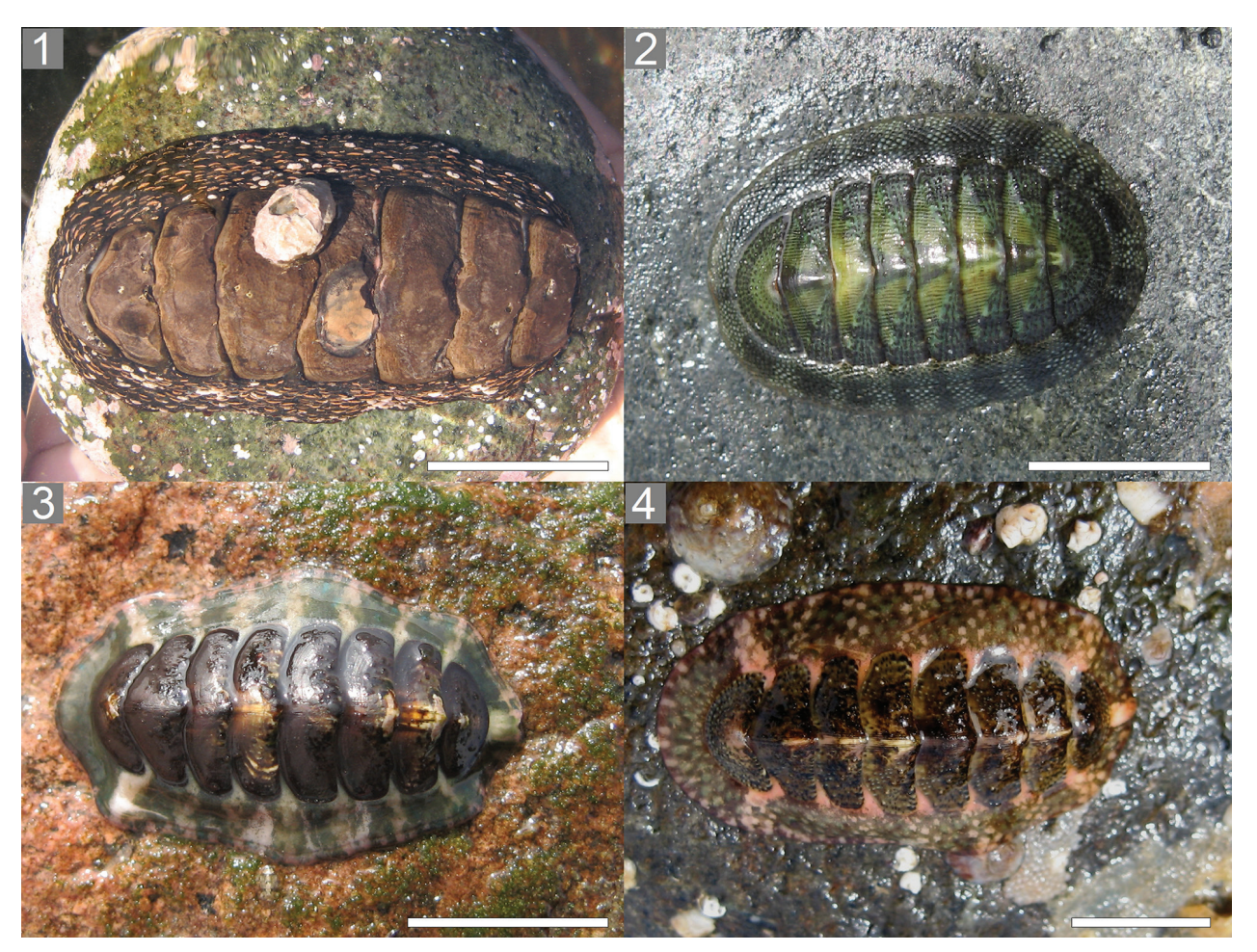
Plate 2. Chiton species photographed in situ; 1. Enoplochiton niger, Isla Playa Ramada, 123 mm; 2. Radsia barnesii, Sur Playa Ramada, 22 mm; 3. Tonicia atrata, Sur de Playa Brava, 30 mm; 4. Tonicia chilensis, Playa Mansa, 32 mm. Scale bars are: 1 cm for 2 and 4, 2 cm for 3 and 4 cm for 1.

central area with numerous uneven longitudinal ribs. Lateral triangle barely raised, with 5–7 irregular nodules. Shell color cream white with reddish brown splotches on central areas, irregular longitudinal dark reddish brown bands on lateral triangles, and occasional dark reddish brown on jugum. Girdle light greenish brown with faint trace of alternating lighter bands in some specimens. Interior of valves white (After Bullock 1988).