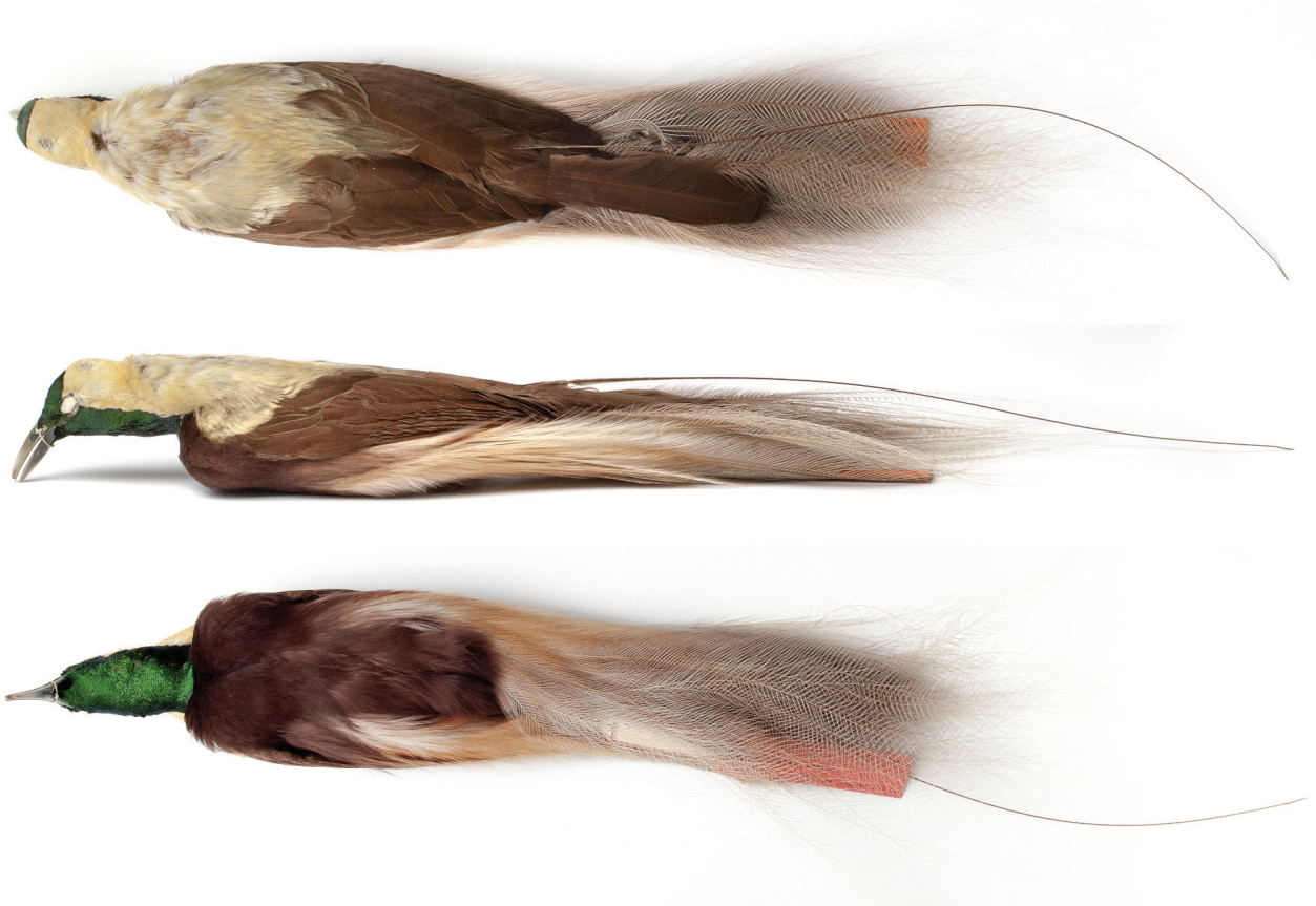
Figure 3. The holotype (ZMB 31049) of Paradisaea maria Reichenow, 1894, in dorsal, lateral, and ventral view.