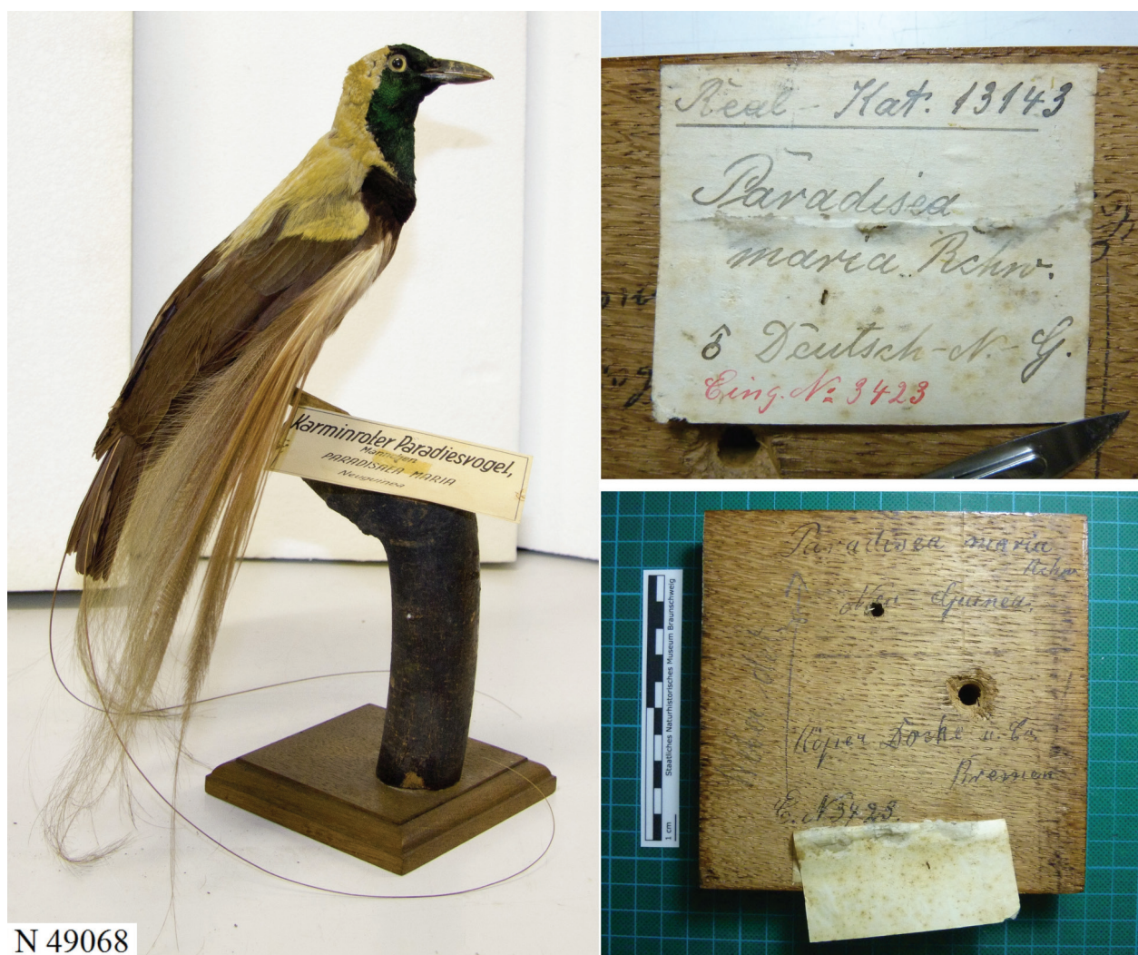
Figure 4. The male specimen SNMB N49068 of P. maria in the Staatliches Naturhistorisches Museum in Braunschweig. The information written on the underside of the pedestal in black ink is as follows: “ Paradisea maria R[ei]ch[eno]w. Neu-Guinea [= New Guinea] Körper Locke u. Co. Bremen C. N. 3423. Weber [?] det. [?]”. The white label written with pencil, which partly sticks above the former ink writing, reads as follows: “Real. Kat. 13143 Paradisea maria Richw. ♂ Deutsch-N.-G. Eing. N° 3423” (= Realia Catalogue No. 13143, Paradisea maria Reichenow, ♂, German New Guinea, Entrance No. 3423).

line with the species name. This additional label reads as follows: “Real. Kat. 13143 Paradisea maria Richw. ♂ Deutsch-N.-G. Eing. No. 3423” (= Realia Catalogue No. 13143, Paradisea maria Reichenow, ♂, German New Guinea, Entrance No. 3423) (Fig. 4).