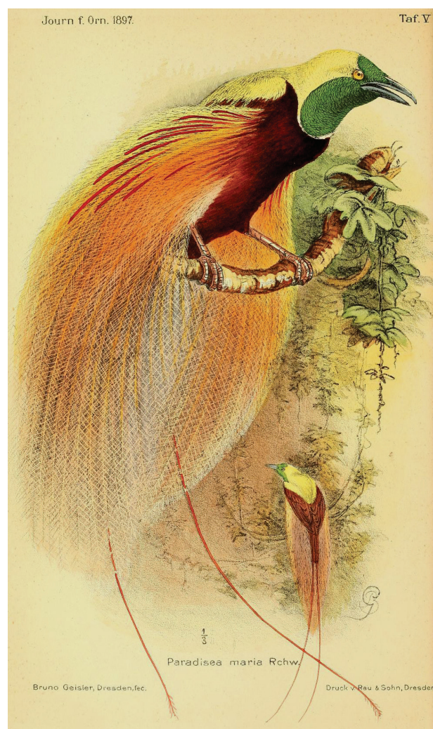
Figure 1. Plate of the male hybrid bird of paradise Paradisaea maria from Reichenow (1897).

Hybridisation between different bird species is a relatively common phenomenon. So far about 4,000 combinations of hybrid origin have been identified, about half of which are crossbreedings in captivity (Mc Charty 2006). According to this author, however, the total number of hybridisations in birds is estimated to be much higher, since hybrid specimens are usually difficult to identify.