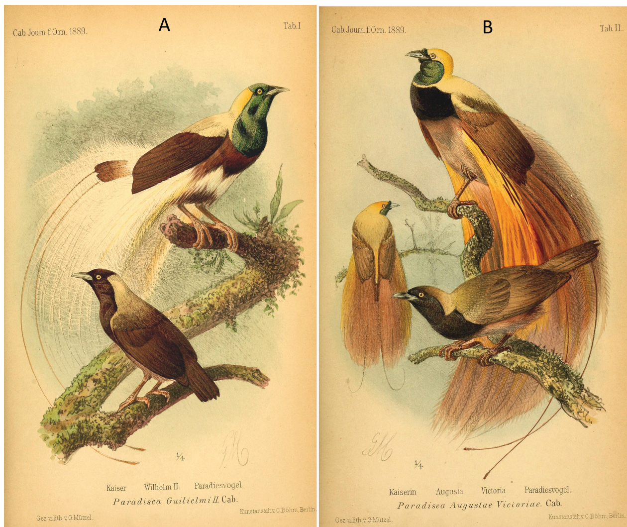
Figure 2. Plates of Paradisaea guilielmi (A) and P. raggiana augustae victoriae (B), the presumed parental species of P. maria , related to the original descriptions by Cabanis (1888).

the species he himself had previously described (see also Rothschild 1898). Subsequently, Rothschild (1910) and Stresemann (1923: 40) suggested, that also P. maria is a hybrid form between P. guilielmi und P. (raggiana) augustae victoriae . The latter discussed a second specimen from the Berlin museum (ZMB 951) that was allegedly collected by Dr Bürgers during the German Empress Augusta (now Sepik) River Expedition in 1912–1913. Subsequently, however, Stresemann (1925) corrected that the original label of this voucher specimen had been mixed up and that it was actually collected by H. Andechser, a planter from Singana, at the southern slopes of the Herzoggebirge (the Herzog mountains) south of Lae at the base of the Huon Peninsula. Later, Stresemann (1930a) even mentioned five specimens of Maria's bird of paradise, which he had examined in the ornithological collections in Berlin (the holotype ZMB 31049, Fig. 3) and Tring (UK), respectively. In the early 1930s, the four specimens from Walter Rothschild's (1868–1937) famous bird collection at Tring were sold to the American Museum of Natural History in New York (LeCroy 2014).