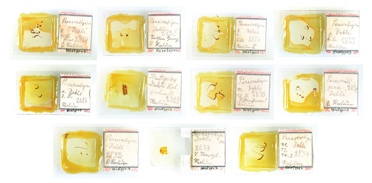
Figure 2. Examples of microscope slides from the Karl Verhoeff collection bearing dissected parts of the anatomy. ZMB 3840a–k, the complete type series of slides belonging to Parascutigera dahli Verhoeff, 1904 collected by Friederich Dahl from Ralum in Papua New Guinea; Verhoeff slide numbers 2824–2834. Type material in the slide collection is marked with red lines on the labels and usually complements alcohol material.