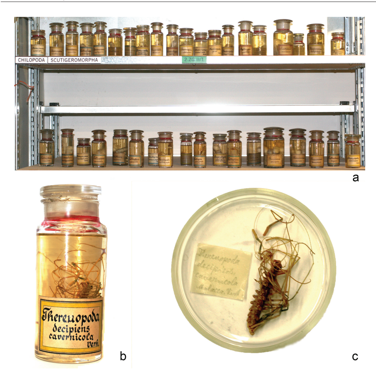
Figure 1. Alcohol material of scutigeromorph centipedes in the Museum für Naturkunde Berlin. a. Overview of the type collection on the shelves. b. Example of a jar containing type material, Theuropoda decipiens cavernicola Verhoeff, 1937 from Malaysia – a junior synonym of Thereuopoda longicornis (Fabricius, 1793) – with the historical external label and red ring indicating type material. c. A syntype of the same species, now removed from the jar, with the historical internal label. Note that some legs have become disarticulated as happens commonly with these centipedes.

19. Thereuopodina tenuicornis Verhoeff, 1905*