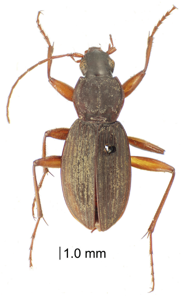
Figure 1. Male holotype, Bryanites graeffii, dorsal view.

brunneous, glabrous longitudinal ridge on each anterior and posterior surface; frontal grooves very shallow, ending posteriorly anterad the anterior supraorbital seta; posterior supraorbital setal position behind posterior margin of eye and 3× as far from eye margin as anterior seta; frons and clypeus not demarked by suture, surfaces convex, continuous, only three very shallow transverse wrinkles medially at position of frontoclypeal suture; labral anterior margin straight, only slightly incurved medially; mentum tooth broad, apex flattened medially, mentum setae positioned posterad curved mentum margin each side of midline; submentum with two setae each side. Pronotum broad, maximal width 1.08× median length; lateral margins only slightly incurved anterad rounded hind angles; broadly longitudinal laterobasal depressions joined by well-defined transverse depression anterad basal convexity; median longitudinal impression very finely incised, absent on basal convexity, continuous to beaded front margin; front angles projected anteriorly, their apex tightly rounded; lateral marginal depression of equal breadth from midlength to front angles, about twice as broad in basal half of pronotum; proepisternum smooth, proepimeron very narrow. Elytra flattened overall, sutural intervals upraised at suture in apical half of length; elytral apex evenly rounded; elytral