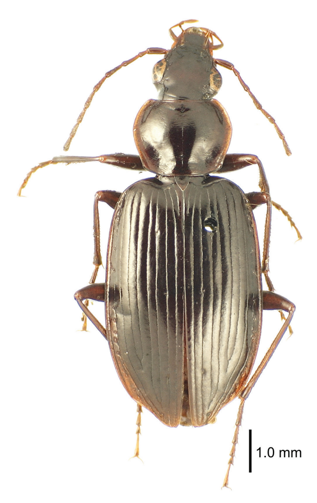
Figure 5. Notagonum kanak female (MNHN), label data: Ncalédonie / ile d. Pins / f. Faustien // MUSEUM PARIS / Ex. Coll. M. MAINDRON / Coll. G. BABAULT 1930 // Colpodes / kanak / Fauvel dedit 1906 (card mounted, abdomen removed, female genitalia and reproductive tract in vial on pin).

crosculpture; 5, margins of prosternal process rounded on posterior face; 6, short elytral sutural tooth present, subapical tooth absent; 7, metatarsomere 4 with shallow apicomedial ventral invagination and short lateral lobes, the outer, or lateral lobe, less than twice the length of the inner lobe.