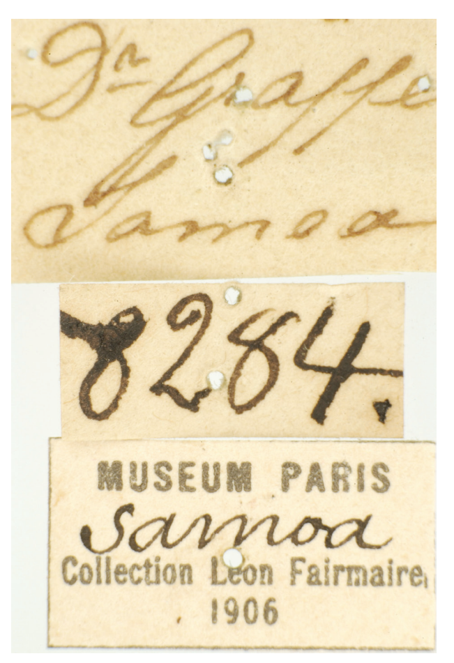
Figure 2. Specimen labels associated with holotype specimen of Bryanites graeffii .

brunneous, glabrous longitudinal ridge on each anterior and posterior surface; frontal grooves very shallow, ending posteriorly anterad the anterior supraorbital seta; posterior supraorbital setal position behind posterior margin of eye and 3× as far from eye margin as anterior seta; frons and clypeus not demarked by suture, surfaces convex, continuous, only three very shallow transverse wrinkles medially at position of frontoclypeal suture; labral anterior margin straight, only slightly incurved medially; mentum tooth broad, apex flattened medially, mentum setae positioned posterad curved mentum margin each side of midline; submentum with two setae each side. Pronotum broad, maximal width 1.08× median length; lateral margins only slightly incurved anterad rounded hind angles; broadly longitudinal laterobasal depressions joined by well-defined transverse depression anterad basal convexity; median longitudinal impression very finely incised, absent on basal convexity, continuous to beaded front margin; front angles projected anteriorly, their apex tightly rounded; lateral marginal depression of equal breadth from midlength to front angles, about twice as broad in basal half of pronotum; proepisternum smooth, proepimeron very narrow. Elytra flattened overall, sutural intervals upraised at suture in apical half of length; elytral apex evenly rounded; elytral