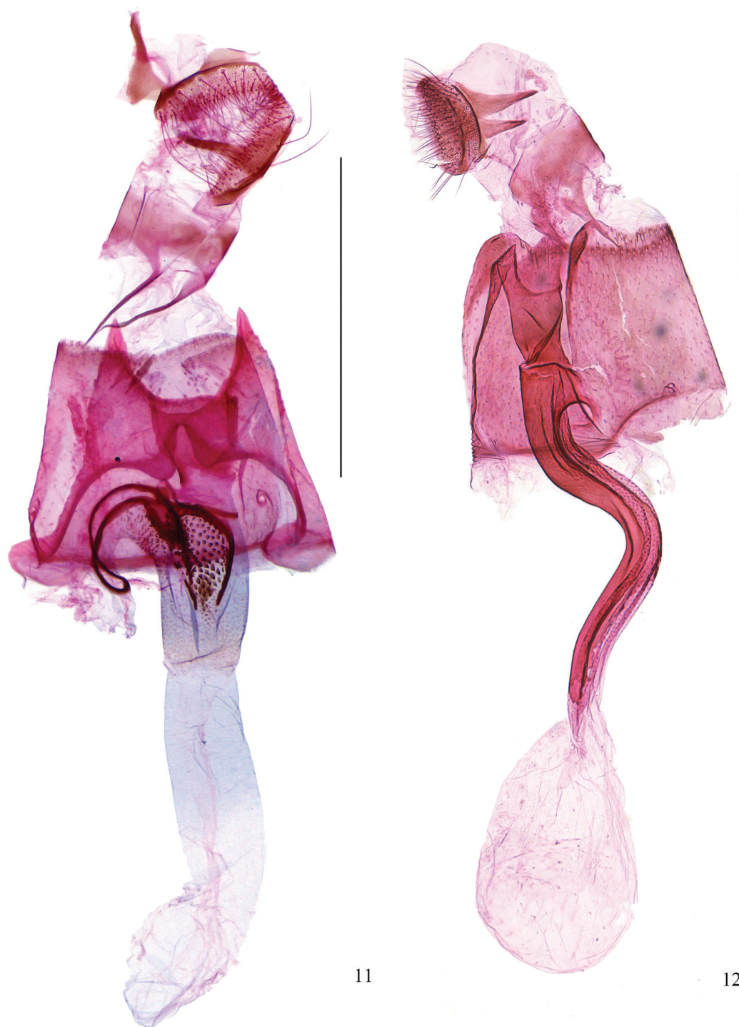
Figures 11–12. Female genitalia of Liocrobyla spp. 11. L. desmodiella , slide no. LTT12612 (NKU); 12. L. indigofera sp. n., slide no. LIU0029, paratype. Scale bars: 0.5 mm.

identical in width, bears some 15 minute teeth along dorsal margin and two longer ventro-apical spines. Phallus shorter than valva. Paired clusters of slender scales and black short scales on membrane between seventh and eighth terga. Ninth segment with tergite heart-shaped, a line of slender scales along lateral side (Fig. 9).