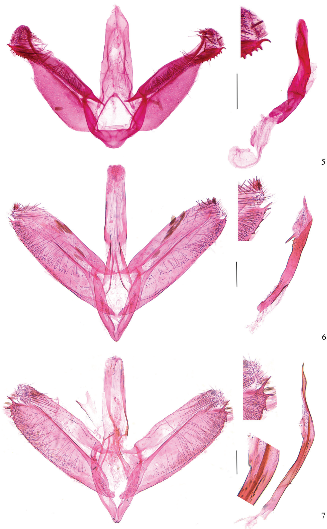
Figures 5–7. Male genitalia of Liocrobyla spp. 5. L. desmodiella , slide no. LTT12611 (NKU); 6. L. lobata , slide no. LIU0028; 7. L. indigofera sp. n., slide no. LIU0030, holotype. Scale bars: 0.2 mm.