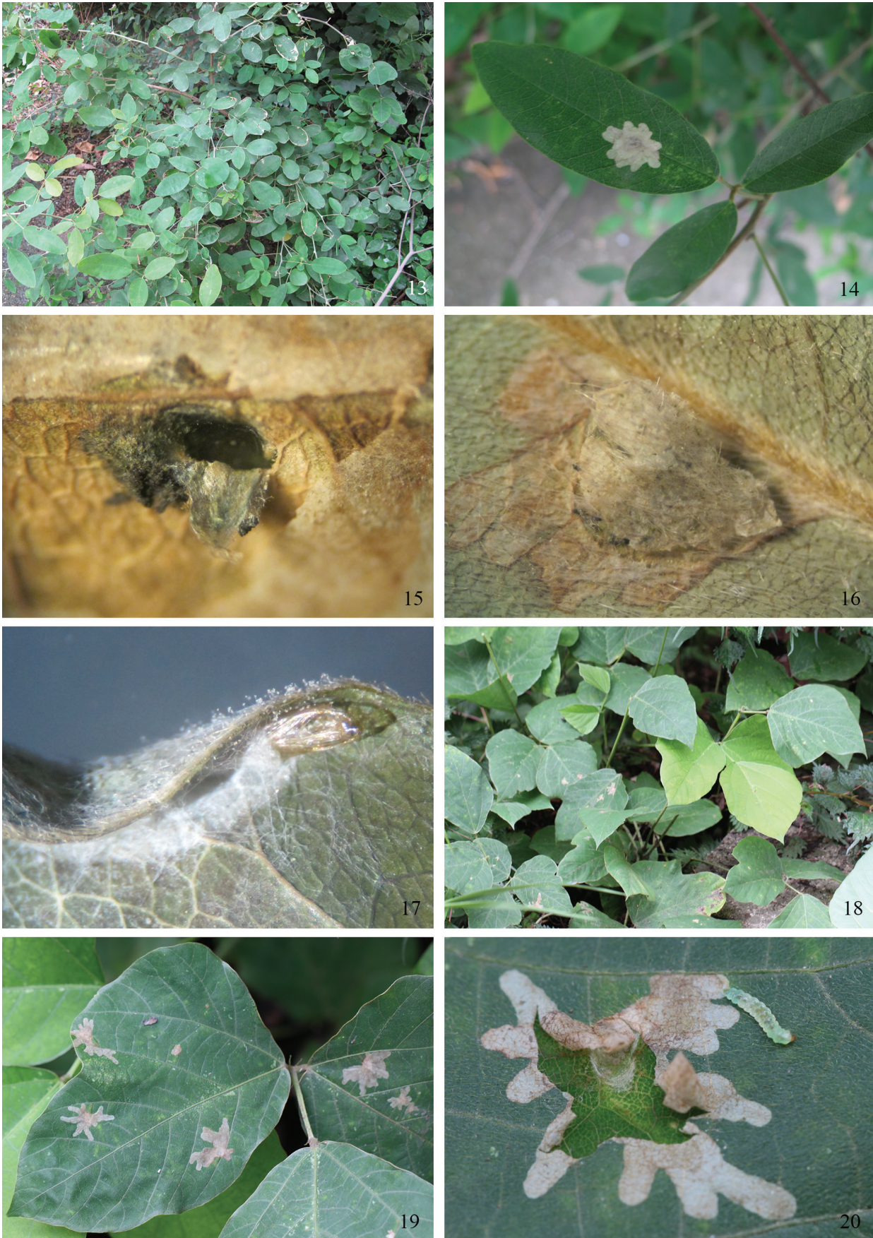
Figures 13–20. Biology of Liocrobyla spp. 13–17. L. desmodiella , 13. host plant, Lespedeza bicolor ; 14. leafmine; 15. frass opening on upper side of leaf; 16. frass opening on lower side of leaf; 17. cocoon and pupal exuviae; 18–20. L. lobata , 18. host plant, Pueraria montana var. lobata ; 19. leafmines; 20. an opened mine with a larva exposed.