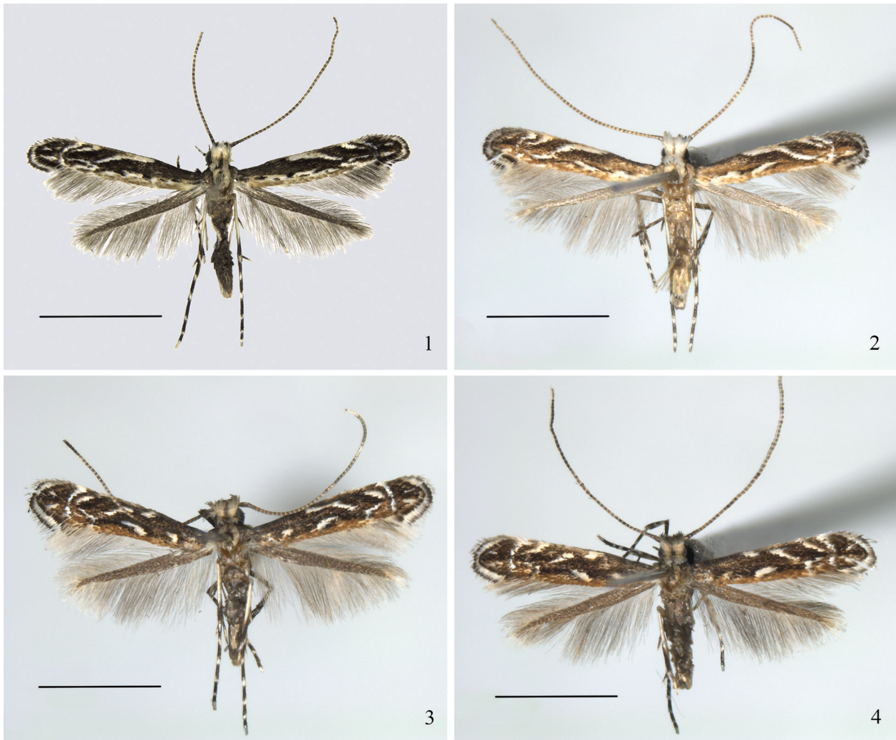
Figures 1–4. Adult of Liocrobyla spp. 1. L. desmodiella ; 2. L. lobata ; 3) L. indigofera sp. n., male, holotype, before dissection; 4. L. indigofera sp. n., female, paratype, before dissection. Scale bars: 2.0 mm.

Distribution. China: Tianjin (new record); Sichuan and Zhejiang (Bai and Li 2011), Japan (Kuroko 1982), Russia Far East (Ermolaev 1987).